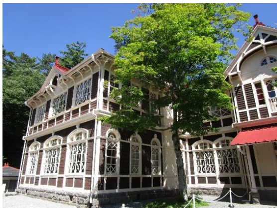
National Important Cultural Property “The Former Mikasa Hotel”